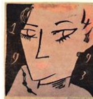
LE PERGOLE TORTE