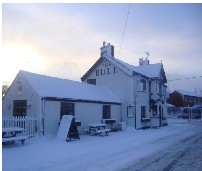
BRRRRRRR.... Winter hits The Bull!!